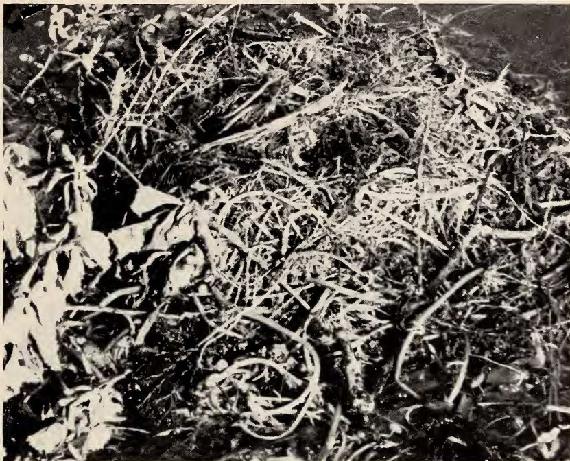
Fig. 4. Nest with eggs completely covered up by departing bird.

the covering up of eggs when the incubating bird was disturbed and left the nest, was common or rare.